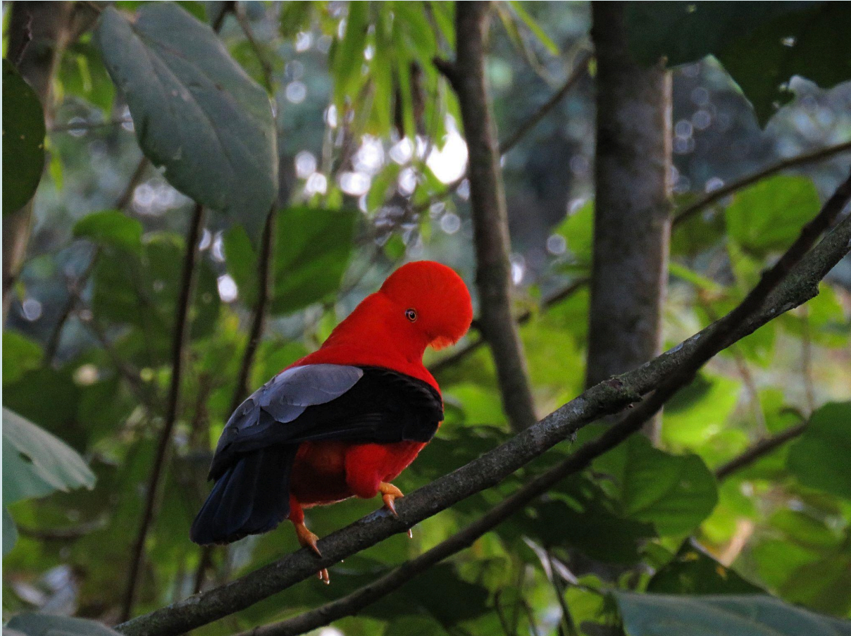
Andean Cock-of-the-Rock by Edwin A.