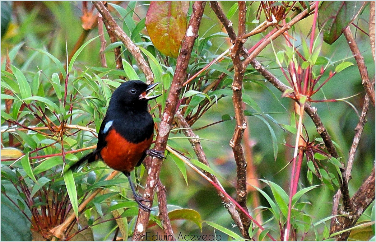
Chestnut-bellied Flowerpiercer by Edwin A.