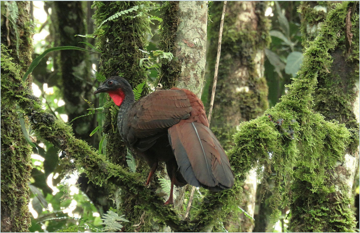
Cauca Guan