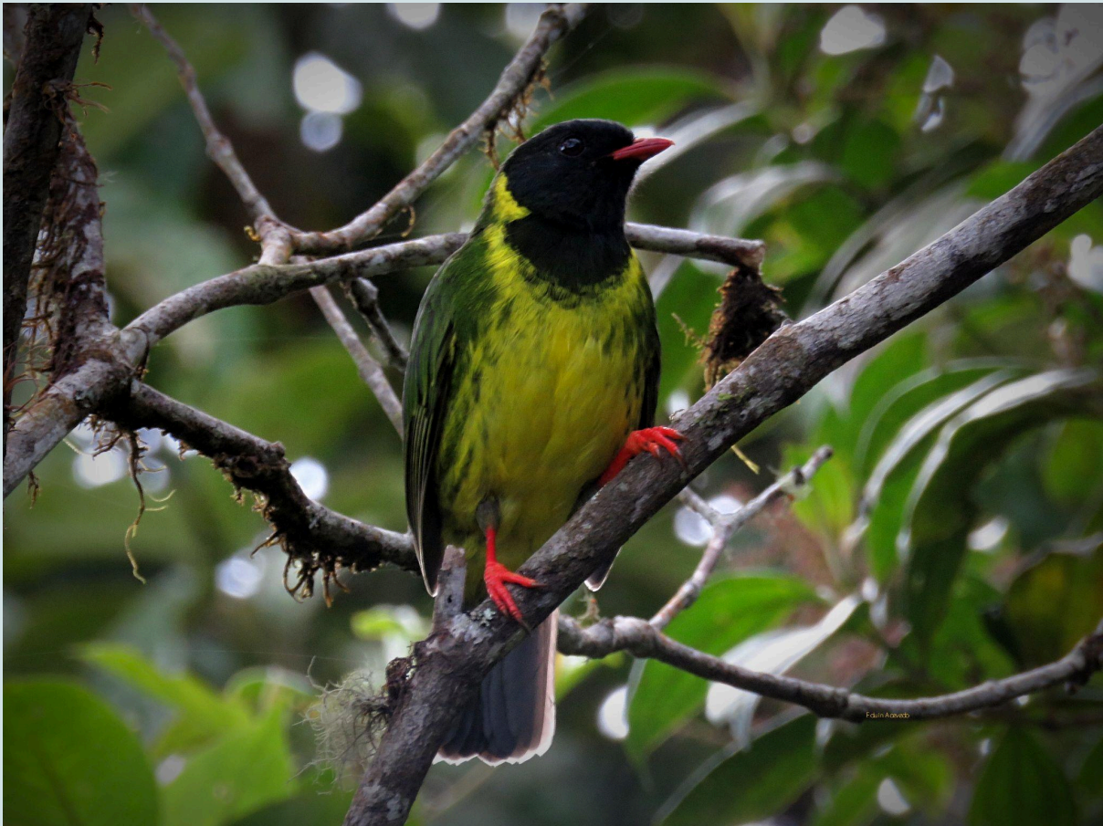
Green-and-Black Fruiteater by Edwin A.