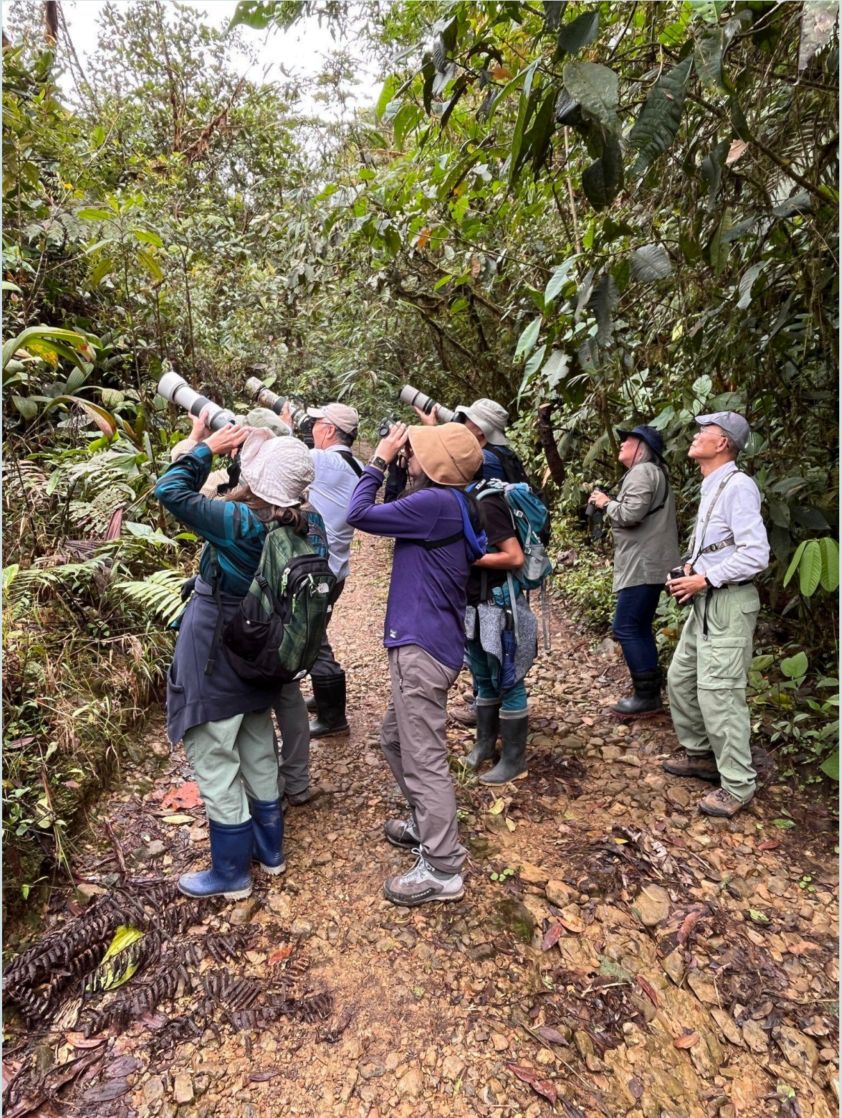
Taiwanese group on action!