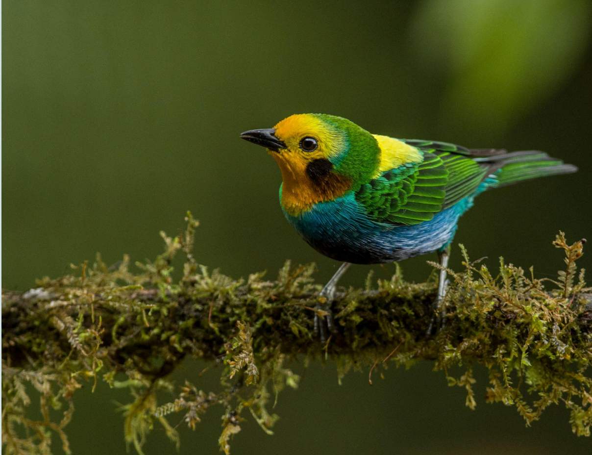
Multicolored Tanager by Johan Florez

This tour focuses on the best reserves in the Central and Western Andes, plus the Choco Bioregion, it visits varied ecosystems to have different bird species from each one, moving from Low montane to dry forest, highlands, and Paramo ecosystem to premontane forest and humid forest to Choco Bioregion and pacific lowlands. The reserves have suitable access, good accommodation; excellent birds, and warming attention. The birding guidance is personalized and flexible to make it a vivid experience.