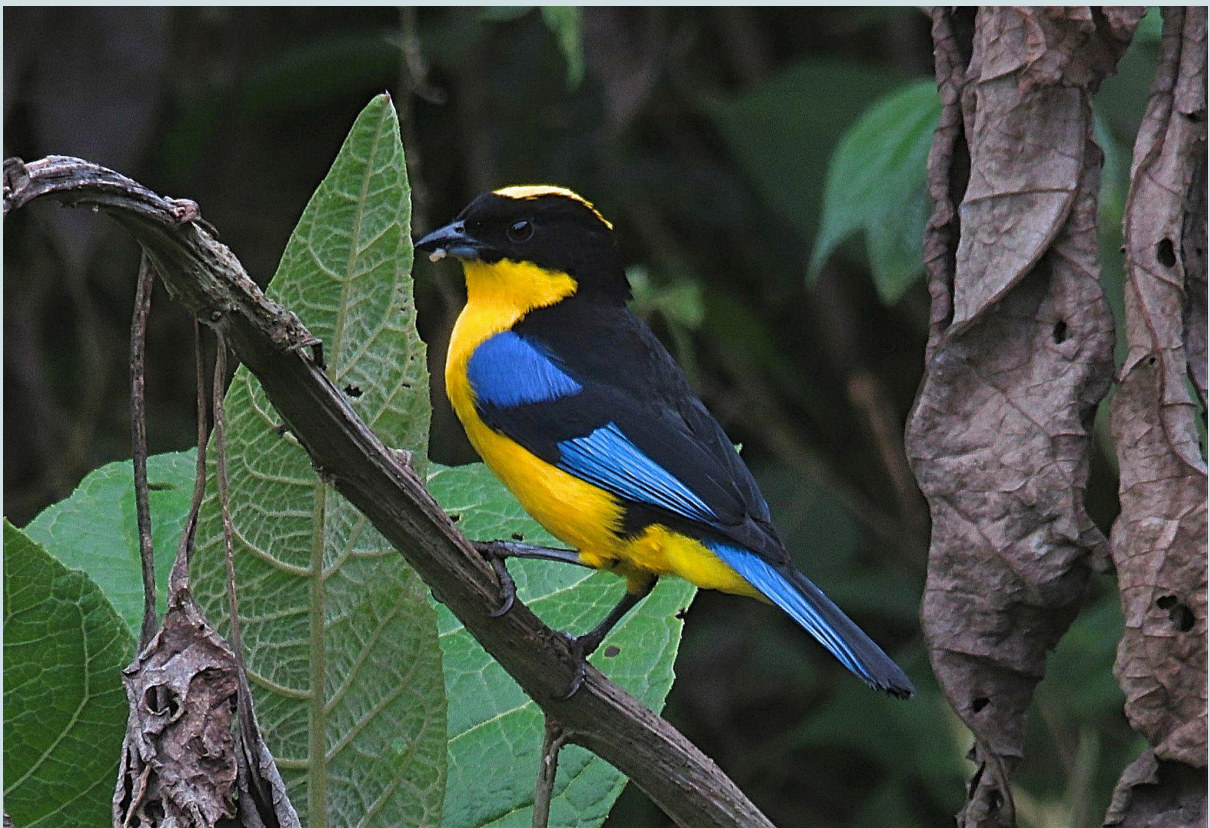
Blue-winged Mountain Tanager by Edwin A.