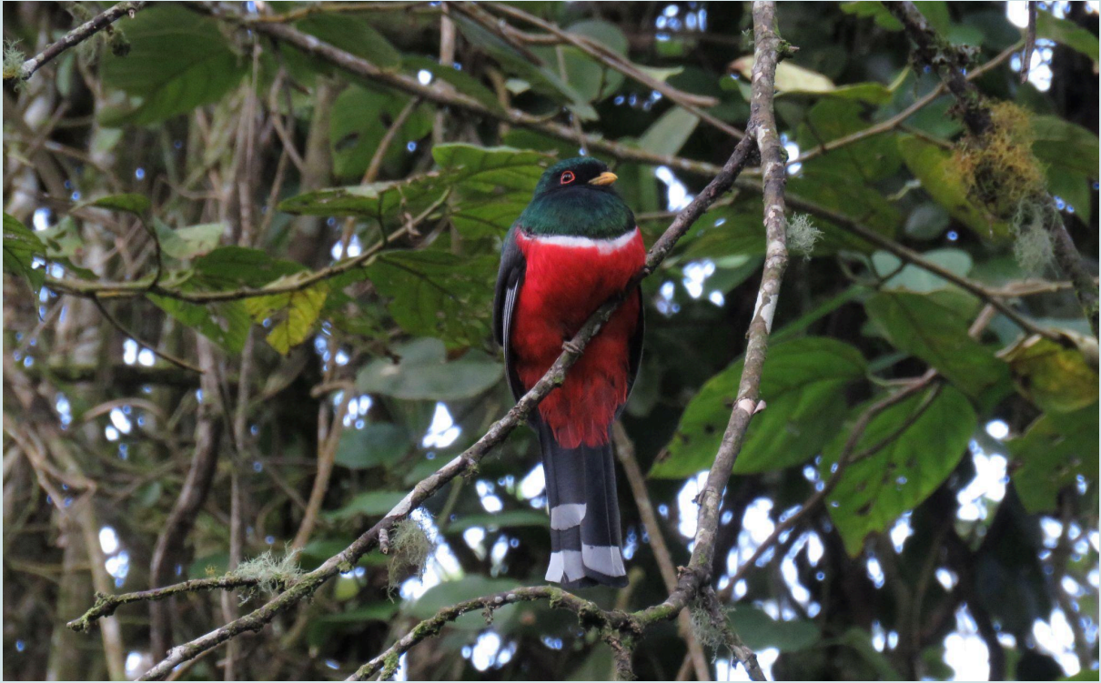
Masked Trogon