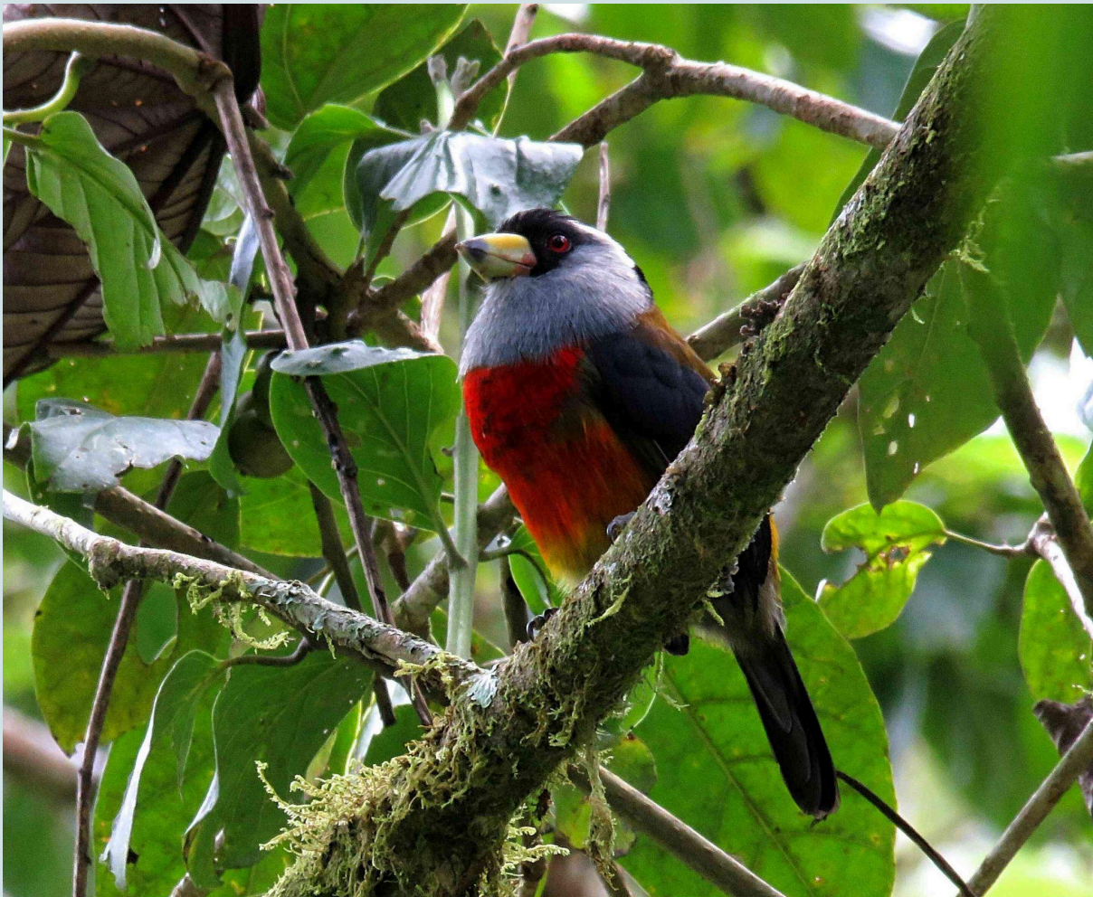
Toucan Barbet by Edwin A.

This area is very rich in biodiversity, it is along with Montezuma and Santa Marta mountains one of the top places in Colombia for birding; the birding is carried out mainly in el Descanso spot, a place held for a humble family who attracts many nice birds to their open backyard connected with the forest around. Some of the species there and along the road are Toucan Barbet (Ne), which used to nest on a tree behind the house; Black-headed Brush-Finch (Ne), Rufous-throated Tanager (Ne), Club-winged Manakin (Ne), White-whiskered Hermit, Green-thorntail, Red-headed Barbet, Sickle-winged Guan, Red-faced Spinetail, Masked Tityra, Green Honeycreeper, Crimson-rumped Toucanet, Chestnut-headed Oropendola, and many more.