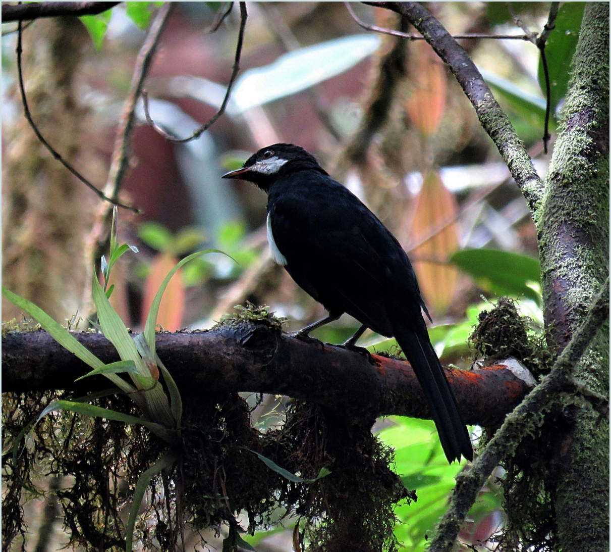
Black Solitaire by Edwin A.