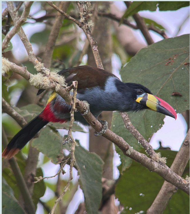
Gray-breasted Mountain-Toucan by Edwin A.