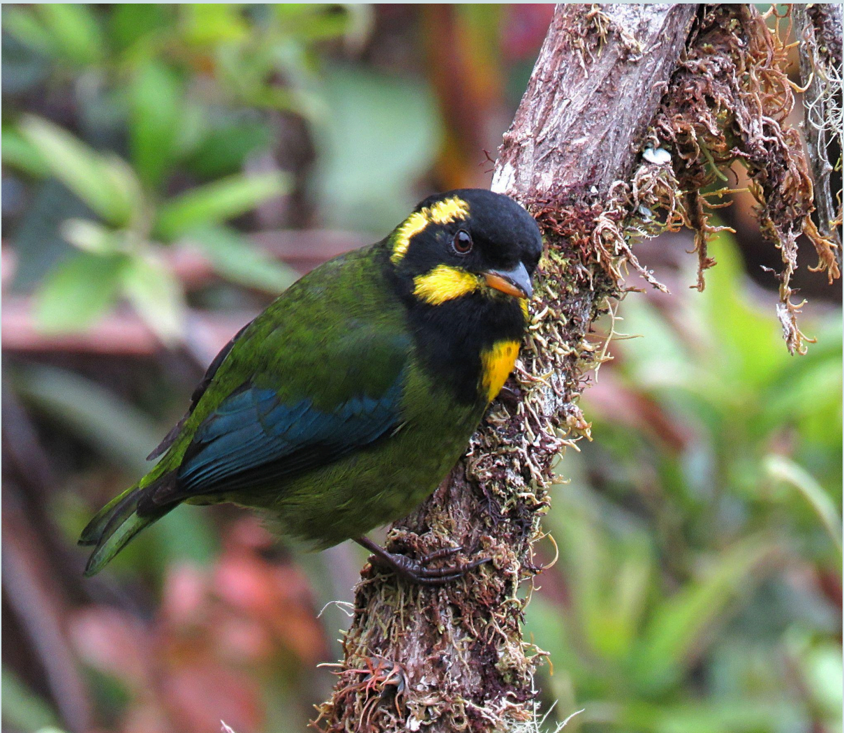
Gold-ringed Tanager