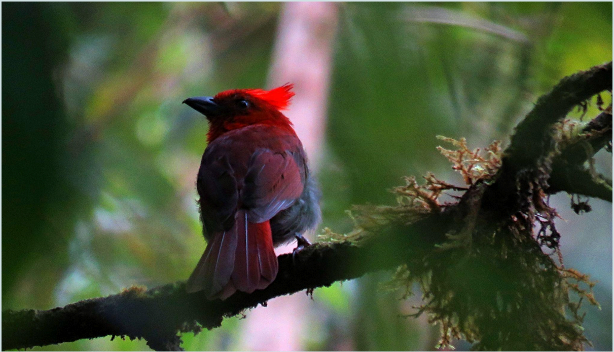
Crested-Ant-Tanager