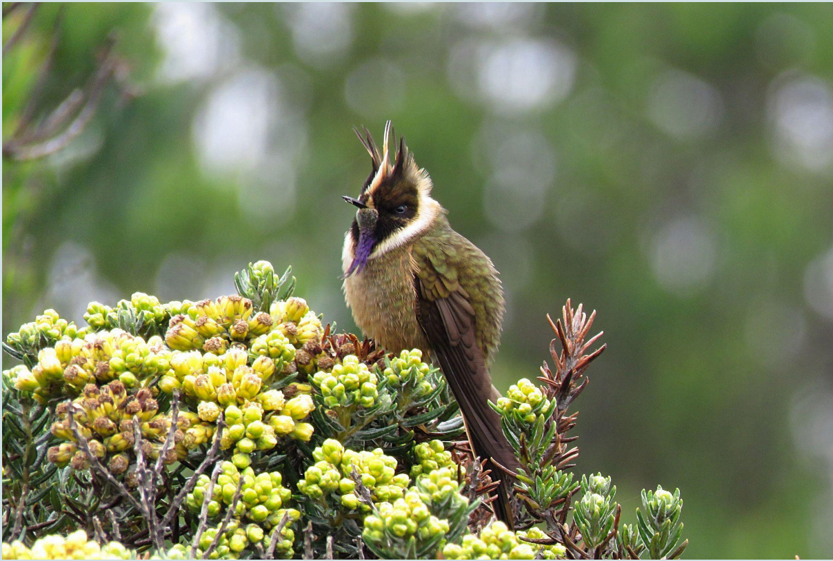
Buffy Helmetcrest by Edwin A.