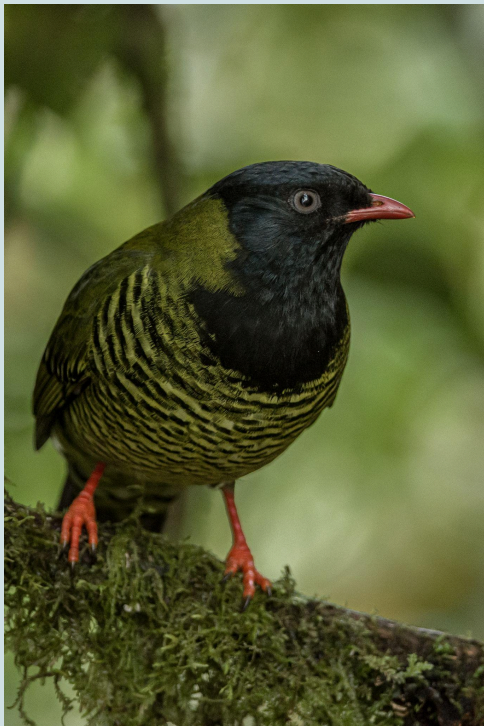
Barred Fruiteater

Hacienda El Bosque to Nevados NP: 25 min drive.