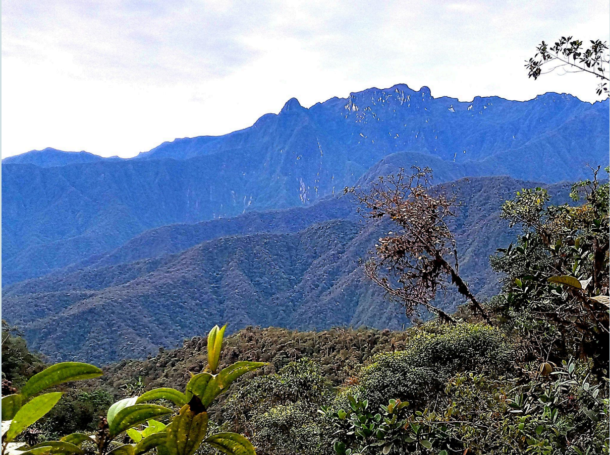
Tatamá National Park - Choco Bioregion